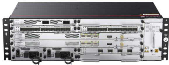
NetEngine 8000 M8 Router (AC)