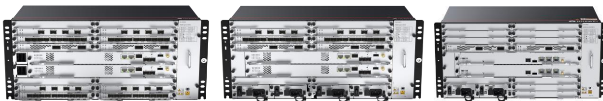
NetEngine 8000 M14 DC

The NetEngine 8000 M14 can be flexibly deployed at multiple locations on the network. It integrates multiple functions, simplifies the network structure, provides various service types, reliable service quality, and intelligent O&M, and leads the IP WAN towards an intelligent network with autonomous driving, providing continuous and surging power for enterprise customers' business success.