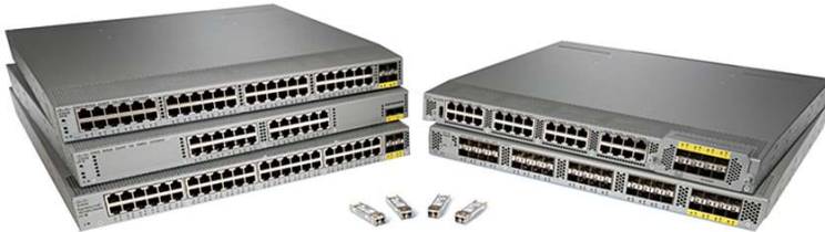
Figure 2. Cisco Nexus 2000 Series Fabric Extenders

The Cisco Nexus 2000 Series Fabric Extenders comprise a category of data center products that provide a server-access platform that scales across a multitude of 1 Gigabit Ethernet, 10 Gigabit Ethernet, unified fabric, rack, and blade server environments. The Cisco Nexus 2000 Series Fabric Extenders are designed to simplify data center architecture and operations by dramatically reducing the points of management and by meeting the business and application needs of a data center. Working in conjunction with Cisco Nexus switches, the Cisco Nexus 2000 Series Fabric Extenders offer a cost-effective and efficient way to support today's Gigabit Ethernet environments while allowing easy migration to 10 Gigabit Ethernet, virtual machine-aware Cisco unified fabric technologies.