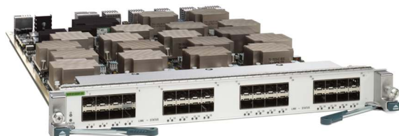
Figure 1. Cisco Nexus 7000 F-Series 32-Port 1 and 10 Gigabit Ethernet Fabric Module

Powerful access control list (ACL) processing supports 32,000 per module, ingress and egress, with the ACL entries addressing Layer 2, 3, and 4 fields. The F1 forwarding engine also supports applications requiring port mirroring, with integrated hardware support for 16 simultaneous unidirectional Cisco Switched Port Analyzer (SPAN) sessions per module. Additionally, the F-Series module delivers integrated Fibre Channel over Ethernet (FCoE), greatly simplifying the network infrastructure and reducing costs by enabling the deployment of unified data center fabrics to consolidate data center traffic onto a single, general-purpose, high-performance, highly available network.