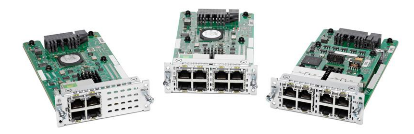
Figure 1. 4-Port, 8-Port, and 8-Port PoE/PoE+ Cisco Gigabit Ethernet LAN Switch Network Interface Modules

The new features for the Gigabit Ethernet LAN Switch NIMs include four quality-of-service (QoS) queues per port, Shaped Deficit Weighted Round Robin (SDWRR), dynamic secure port, intra chassis cascading, up to 30W of PoE/PoE+ per port, and PoE per-port monitoring and policing.