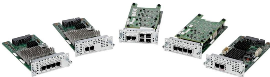
Table 1. Cisco FXO and FXS NIM Types and Feature Comparison