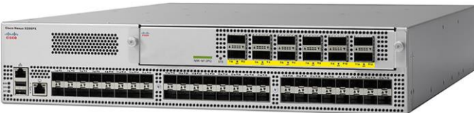
Figure 4. Cisco Nexus 9396PX Switch

The Cisco Nexus 9396TX Switch is a 2RU switch that supports up to 1.92 Tbps of bandwidth and over 1500 mpps across 48 fixed 1/10GBASE-T ports and an uplink module (see Figures 8 and 9 later in this document) that can support up to 12 fixed 40-Gbps QSFP+ ports (Figure 5).