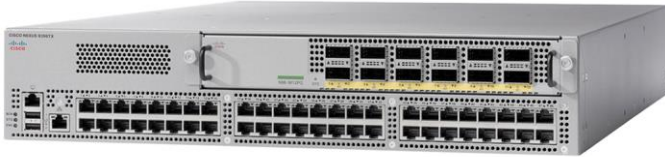
Figure 5. Cisco Nexus 9396TX Switch

The Cisco Nexus 93128TX Switch is a 3RU switch that supports 2.56 Tbps and over 750 mpps across 96 fixed 1/10GBASE-T ports and an uplink module (see Figures 8 and 9 later in this document) that can support up to 8 fixed 40-Gbps QSFP ports (Figure 6).