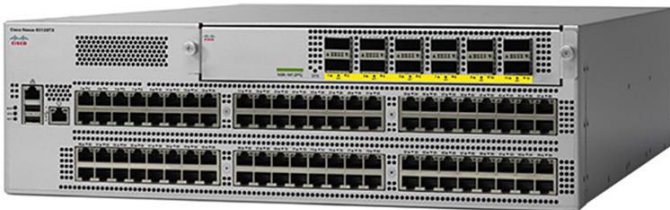
Figure 6. Cisco Nexus 93128TX Switch

The 40-Gbps ports for the Cisco Nexus 9396PX, 9396TX, and 93128TX are provided on an uplink module that can be serviced and replaced by the user. Three uplinks modules are available for Cisco Nexus 9300 platform leaf switches for Cisco ACI.