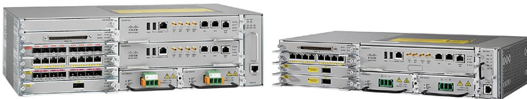
Figure 1. Cisco ASR 903 Router and ASR 902 Router

The Cisco ASR 902 Router and Cisco ASR 903 Router (Figure 1) provide a comprehensive and scalable feature set of Layer 2 VPN (L2VPN) and Layer 3 VPN (L3VPN) services in compact designs.