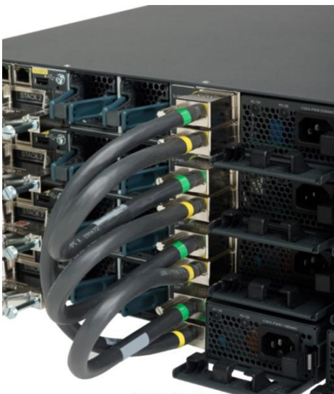
Figure 3. StackPower Connector

The Cisco Catalyst 3750-X Series introduces Cisco StackPower technology, innovative power interconnect system that allows the power supplies in a stack to be shared as a common resource among all the switches. Cisco StackPower unifies the individual power supplies installed in the switches and creates a pool of power, directing that power where it is needed. This feature is available in all Cisco Catalyst 3750-X Series Switches feature sets*. Up to four switches can be configured in a StackPower stack with the special connector at the back of the switch using the StackPower cable**, which is different than the StackWise cables. (See Figure 3.)