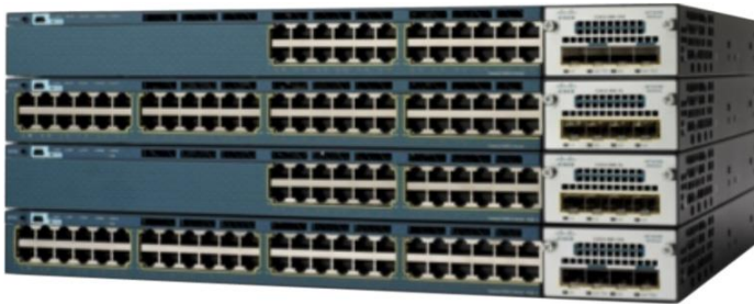
Figure 2. Cisco Catalyst 3560-X Series Switches

Table 2 shows the Cisco Catalyst 3560-X Series configurations.