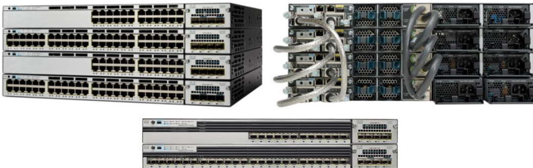
Figure 1. Cisco Catalyst 3750-X Series Switches (Front and Back)

Table 1 shows the Cisco Catalyst 3750-X Series configurations.