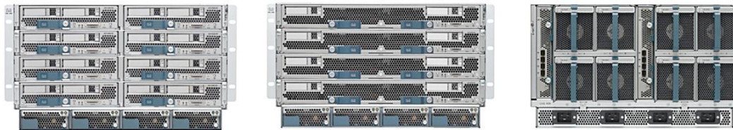
Figure 2. Cisco UCS 5108 Blade Server Chassis with Blade Servers Front and Back

Four hot-swappable power supplies are accessible from the front of the chassis, and single-phase AC, -48V DC, and 200 to 380V DC power supplies and chassis are available. These power supplies are up to 94 percent efficient and meet the requirements for the 80 Plus Platinum rating. The power subsystem can be configured to support nonredundant, N+1 redundant, and grid-redundant configurations. The rear of the chassis contains eight hot-swappable fans, four power connectors (one per power supply), and two I/O bays that can support either Cisco UCS 2000 Series Fabric Extenders or the Cisco UCS 6324 Fabric Interconnect. A passive midplane provides up to 80 Gbps of I/O bandwidth per server slot and up to 160 Gbps of I/O bandwidth for two slots. The chassis is capable of supporting future 40 Gigabit Ethernet standards.