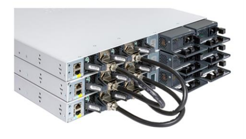
Figure 5. Cisco Catalyst 9300 Series modular uplink models stack (C9300/C9300X SKUs) and fixed uplink models stack (C9300L SKUs)