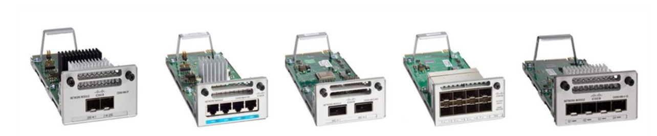
Figure 3. Cisco Catalyst 9300 Series Network Modules