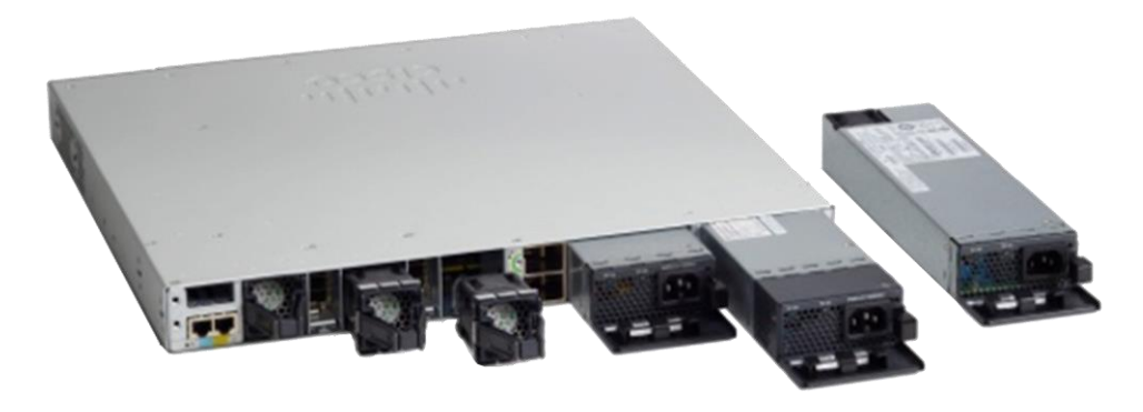
Figure 4. Cisco Catalyst 9300 Series Dual Redundant power supplies

Cisco Catalyst 9300 Series switches support dual redundant power supplies. The switches ship with one power supply by default, and the second power supply can be purchased when the switch is ordered or at a later time. If only one power supply is installed, it should always be in power supply bay #1. The switches also ship with three field-replaceable fans. Power Supplies are common across the Catalyst 9300 Series.