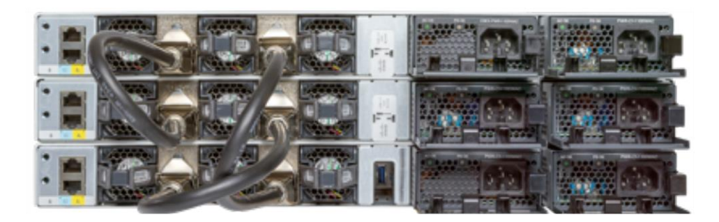
Figure 6. Cisco Catalyst 9300 Series fixed uplink models with optional stack kit