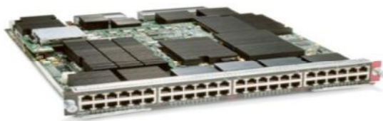
Figure 1. Cisco Express Forwarding 720 10/100/1000 Interface Module (part number WS-X6748-GE-TX) with Distributed Cisco Express Forwarding Daughter Card (part number WS-F6700-DFC3)

1 Queues Legend: 1p3q1t = 1 priority queue, 3 round robin queues, 1 threshold