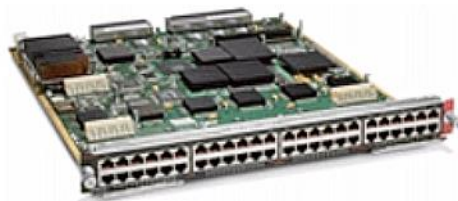
Figure 5. Cisco Classic 48-Port 10/100/1000 Module (part number WS-X6148E-GE-45AT) with 802.3af PoE and 802.3at PoE+