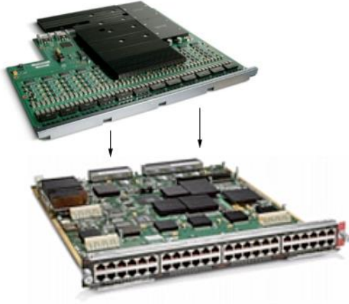
Figure 7. Cisco Classic 96-Port 10/100 802.3af PoE Module (part number WS-X6148X2-45AF)