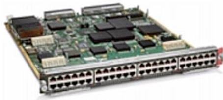
Figure 3. Cisco Express Forwarding 256 Copper 10/100 Interface Module (part number WS-X6548-RJ-45)