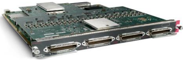
Figure 10. Cisco Classic 96-Port 10/100 (with field upgrade option to 802.3af PoE module) (part number WS-X6196-RJ-21)