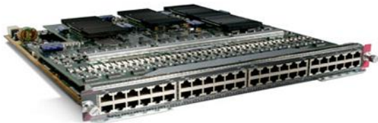
Figure 8. Cisco Classic 48-Port 10/100 802.3af PoE Module (part number WS-X6148A-45AF)