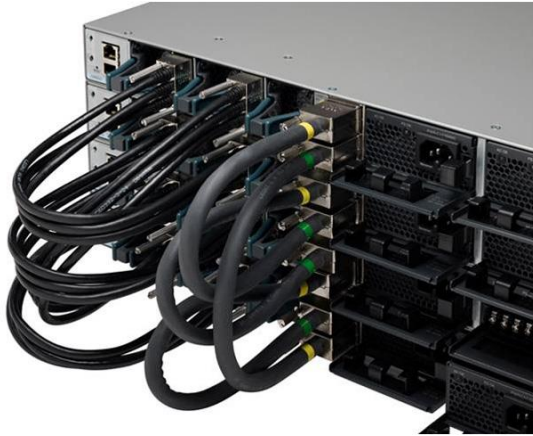
Figure 1. Cisco StackPower