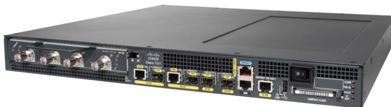
Figure 1. Cisco 7201

Benefits of the Cisco 7201 include the following (refer to Table 1 for details):