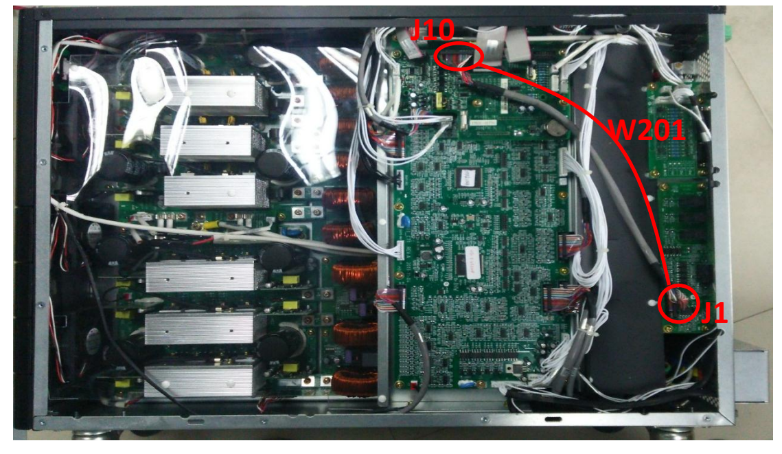
Figure 2 W201 cable

2. Connect the signal cable W201 (DRY Contact board J1 to communication transfer board J10), as is shown in figure 2.