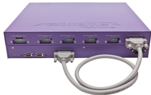
EPS-C2 Connected to a Summit X440