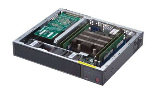
FIGURE 3: NETQ HARDWARE AND NETQ CLOUD APPLIANCES