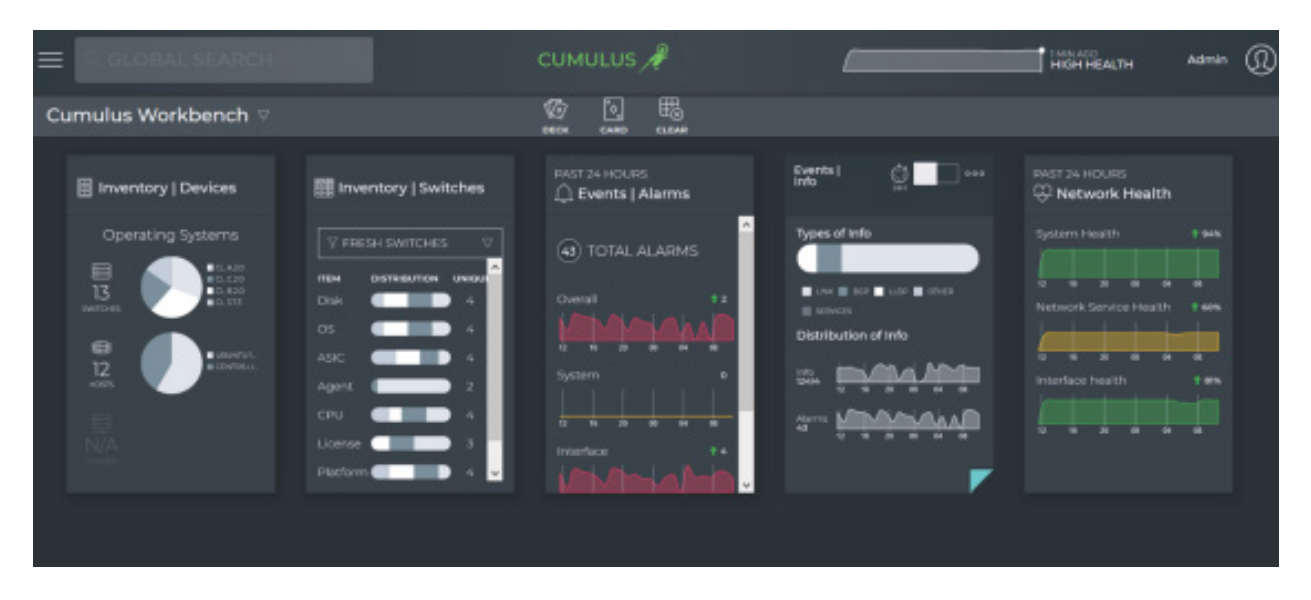
FIGURE 2: CUMULUS NETQ GUI

Unlike other network operations tools, NetQ delivers significant operational improvements to your network management and maintenance processes. It simplifies the data center network by reducing the complexity through real-time visibility into hardware and software status and eliminating the guesswork associated with investigating issues through the analysis and presentation of detailed, focused data.