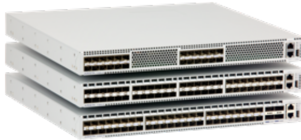
Arista 7150 Series

Designed to suit the requirements of demanding environments such as ultra low latency financial ECNs, HPC clusters and cloud data centers, the class-leading deterministic latency from 350ns is coupled with a set of advanced tools for monitoring and controlling mission critical environments.