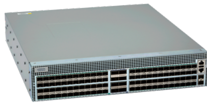
Arista 7050SX3-96YC8 : 96x 25G SFP and 8x 100G QSFP ports

The Arista 7050SX3-96YC8 is a 2RU system with 96 ports of 25G and 8 ports of 100G with an overall throughput of 6.4 Tbps bi-directional. The high density SFP ports can be configured in groups of 4 to run either at 25G or a mix of 10G/1G speeds. The QSFP100 ports allow for a choice of 5 speeds including 100GbE, 40GbE, 4x10GbE, 4x25GbE or 2x 50GbE with a wide choice of transceivers and cables enabling a choice of combinations for both leaf and spine deployment. With low latency and no oversubscription, the switch is optimized for high density server environments with native 25G connections.