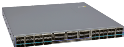
Arista 7050SX3-48YC12 : 48x 25G SFP and 12x 100G QSFP ports

The Arista 7050SX3-48YC12 is a 1RU system with 48 ports of 25GbE SFP and 12 ports of 100GbE QSFP100 with an overall throughput of 4.8 Tbps. The high density SFP ports can be configured in groups of 4 to run either at 25G or a mix of 10G/1G speeds. The QSFP ports allow for a choice of 5 speeds including 100GbE, 40GbE, 4x10GbE, 4x25GbE or 2x 50GbE with a wide choice of transceivers and cables enabling a choice of combinations for both leaf and spine deployment. With low latency and no oversubscription, the switch is optimized for high performance server and storage deployments.