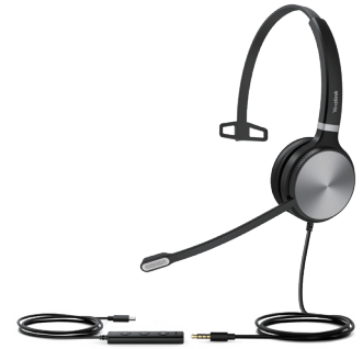
UH36 Mono Teams UH36 Mono UC

Deeply integrated with Yealink IP phones that the advanced features, such as volume synchronization and multiple calls control, are just right at your fingertips.