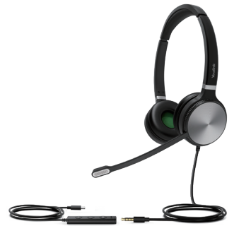
UH36 Dual Teams UH36 Dual UC