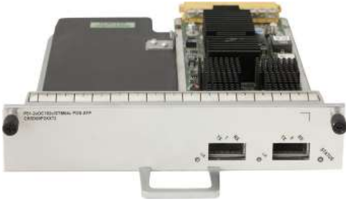
2-Port OC-192c/STM-64c POS-XFP Flexible Card(P51-A)