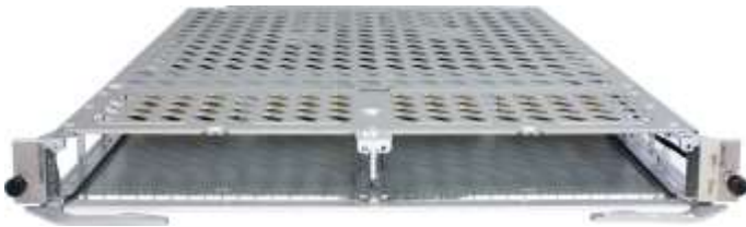
Flexible Card Line Processing Unit(LPUF-120)