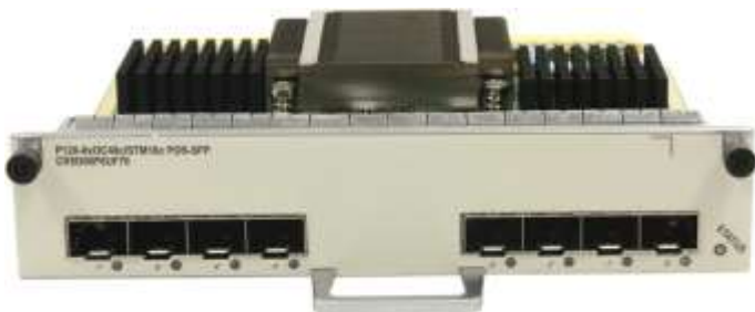
8-Port OC-48c/STM-16c POS-SFP Flexible Card(P120)