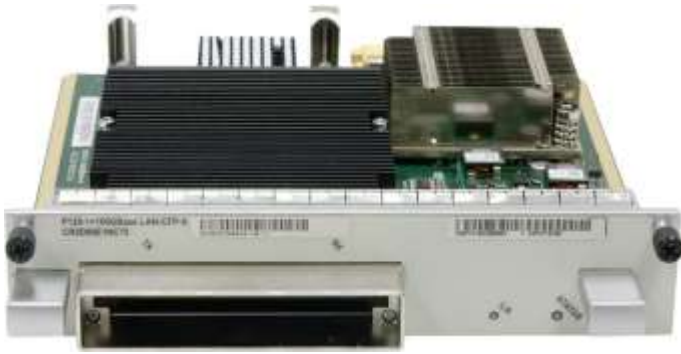
1-Port 100GBase-CFP Flexible Card A(P120-A)