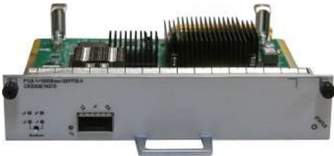
1-Port 100GBase-QSFP28 Flexible Card A(P120-A)