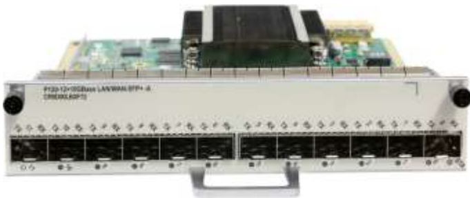
12-Port 10GBase LAN/WAN-SFP+ Flexible Card A(P120-A)