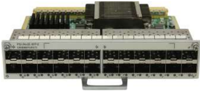
24-Port 1000Base-X-SFP Flexible Card E(P52-E)