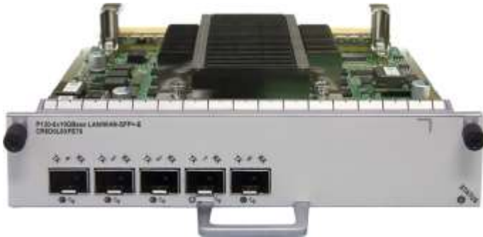
5-Port 10GBase LAN/WAN-SFP+ Flexible Card E(P120-E)