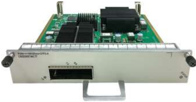
1-Port 100GBase-CFP2 Flexible Card A(P120-A)