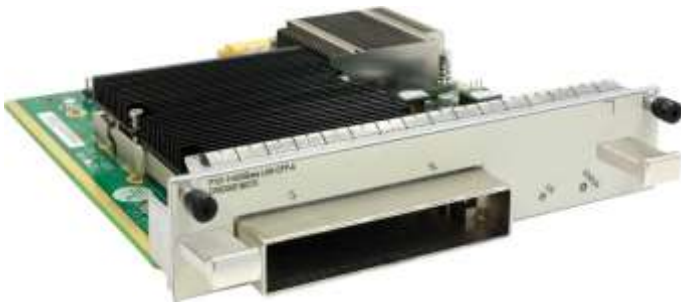
1-Port 40GBase LAN-CFP Flexible Card A(P101-A)