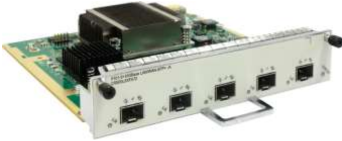
5-Port 10GBase LAN/WAN-SFP+ Flexible Card A(P101-A)