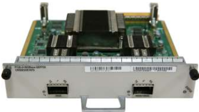
2-Port 50GBase/1-Port 100GBase-QSFP28 FlexE Flexible Card (P120)