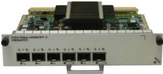
6-Port 10GBase LAN/WAN-SFP+ Flexible Card E(P120-E)