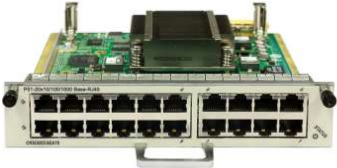
20-Port 10/100/1000Base-RJ45 Flexible Card A(P51-A)