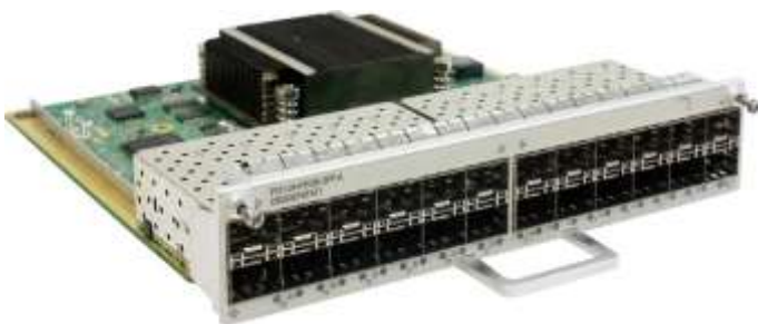
24-Port 100/1000Base-X-SFP Flexible Card A(P101-A)