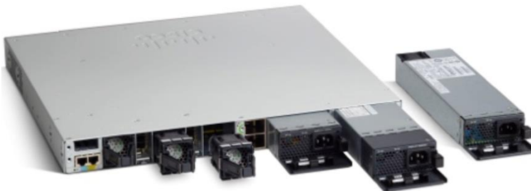
Figure 3. Cisco Catalyst 9300 Series Dual Redundant Power Supplies

Table 3 lists the different power supplies available in these switches and available PoE power.