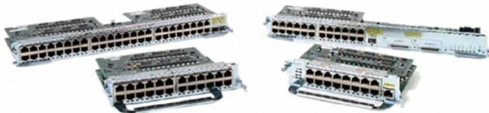
Figure 1. Cisco EtherSwitch Service Modules with IEEE 802.3af Support

The new Cisco EtherSwitch service modules, pictured in Figure 1, greatly expand the capabilities of integrated switching within Cisco routers by providing support for new features such as IEEE 802.3af Power over Ethernet (PoE), local Layer 3 switching, Cisco Network Assistant and Cisco Emergency Responder, and Cisco StackWise™ interfaces (available on NME-XD-24-1S-P only), as well as common software and features with Cisco Catalyst® 3750 and 3750-E Series Switches. Additionally, the new Cisco EtherSwitch service modules are the first modules that can take full advantage of the increased performance capabilities and new form factors of the enhanced network module slot on Cisco integrated services routers. (Table 7 provides a list of supported platforms).