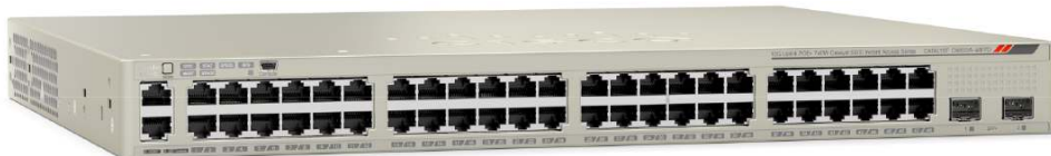
Figure 1. Cisco Catalyst 6800ia Series Switches

Cisco® Catalyst® Instant Access is a solution to dramatically simplify the campus network operations, a game changer for business transformation creating opportunities for innovation in the campus. It simplifies operation through a single point of operation and management for campus access and backbone. The solution is composed of a Cisco Catalyst 6500 or 6800 core switch and Cisco Catalyst 6800ia Series Switches (Figure 1). The Cisco Catalyst 6800ia access switches are connected to the Cisco Catalyst 6500 or 6800, and the entire configuration works as a single extended switch with a single management domain. This allows Catalyst 6500/6800 features to be extended to network access e.g. MPLS/EVN in access. This solution is optimized for wired devices with centralized wireless. The access switches can support Power over Ethernet Plus (PoE+), and the access switches can be stacked together for higher port density and resiliency. IT has flexibility to deploy the Cisco Catalyst Instant Access solution on all or a subset of the campus network. IT can reuse existing network cabling infrastructure to deploy this solution.