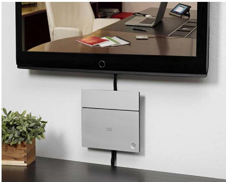
Figure 2. Cisco SX20 Quick Set on optional wall mount