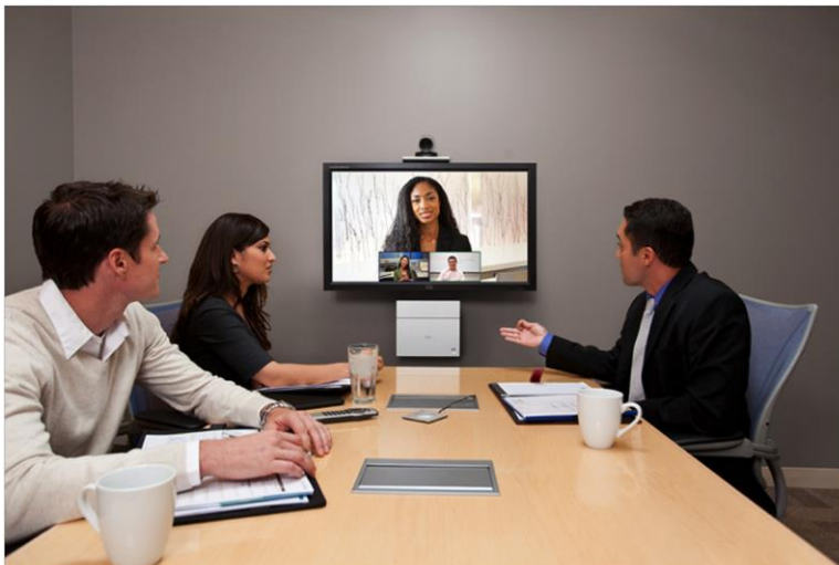
Figure 1. Cisco SX20 quick set in a small meeting room environment

Now, the SX20 Quick Set supports cloud registration to Cisco Webex for even faster and more cost effective deployment 1 . Cisco SX20 Quick Set is designed to truly extend the power of in-person to everyone, everywhere.