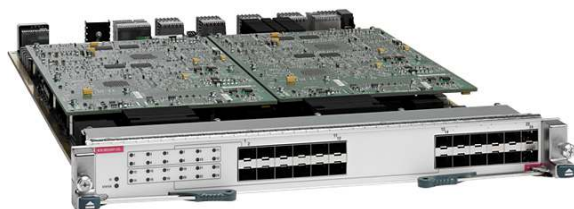
Figure 1. Cisco Nexus 7000 M2-Series 24-Port 10 Gigabit Ethernet Module with XL Option

The Cisco Nexus 7000 Series Switches provide the foundation of the Cisco ® Unified Fabric. They are a modular data center-class product line designed for highly scalable 10 Gigabit Ethernet networks. The fabric architecture scales beyond 15 terabits per second (Tbps), and is designed to support high-density 40 and 100 Gigabit Ethernet deployments. To meet the requirements of the most mission-critical network environments, the switches deliver continuous system operations and virtualized services. The Cisco Nexus 7000 Series is powered by the proven Cisco NX-OS Software operating system, with enhanced features to deliver real-time system upgrades with exceptional manageability and serviceability. The software's innovative unified fabric design is purpose-built to support consolidation of IP and storage networks on a single lossless Ethernet fabric.