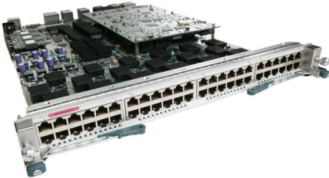
Figure 2. Cisco Nexus 7000 M1-Series 48-Port Gigabit Ethernet SFP Module