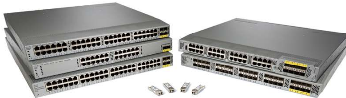
Figure 2. Cisco Nexus 2000 Series Fabric Extenders

The Cisco Nexus 2000 Series Fabric Extenders comprise a category of data center products that provide a server-access platform that scales across a multitude of 1 Gigabit Ethernet, 10 Gigabit Ethernet, unified fabric, rack, and blade server environments. The Cisco Nexus 2000 Series Fabric Extenders are designed to simplify data center architecture and operations by dramatically reducing the points of management and by meeting the business and application needs of a data center. Working in conjunction with Cisco Nexus switches, the Cisco Nexus 2000 Series Fabric Extenders offer a cost-effective and efficient way to support today's Gigabit Ethernet environments while allowing easy migration to 10 Gigabit Ethernet, virtual machine-aware Cisco unified fabric technologies.