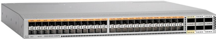
Figure 2. Cisco Nexus 2348UPQ Fabric Extender (Port View)

The Cisco Nexus 2348UPQ fabric extender (Figure 2) is a general-purpose unified port - capable (currently, Fibre Channel functions are supported only in Nexus 5600 since 7.3(0) N1 (1)) 1/10 Gigabit Ethernet fabric extender for workloads such as large-volume databases, distributed storage, and video editing. The Cisco Nexus 2348UPQ supports 48 x 1- and 10-Gbps host unified ports as well as up to six 40-Gbps uplink ports to the parent switch. The 40-Gbps uplinks support BiDi optics for simple connectivity using your existing cable plan. The unified ports provide connectivity to 2-, 4-, 8-, and 16-Gbps Fibre Channel (24 ports for 16 Gbps) as well as 1 and 10 Gigabit Ethernet and FCoE connectivity options (currently, Fibre Channel functions are supported only in hardware). The Cisco Nexus 2348UPQ has a deep 32-MB shared buffer that helps increase performance, and it supports FCoE and Data Center Bridging (DCB) network technologies, which boost the reliability, efficiency, and scalability of Ethernet networks. These features provide support for multiple traffic classes over a lossless Ethernet fabric, enabling consolidation of LAN, SAN, and cluster environments.