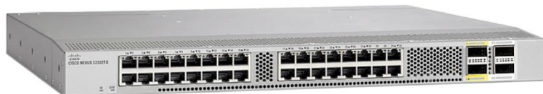
Figure 6. Cisco Nexus 2332TQ Fabric Extender (Port View)

The Cisco Nexus 2332TQ (Figure 6) is a low-port-count, low-power 10GBASE-T platform with 32 100MBASE-T and 1/10GBASE-T HIF ports as well as four 40-Gbps uplink ports to the parent switch. This platform is well suited for customers with lower power requirements and with lower port density in the rack. The 40-Gbps uplinks support BiDi optics for simple connectivity using your existing cable plan, while lowering power and solution costs. The Cisco Nexus 2332TQ supports FCoE.