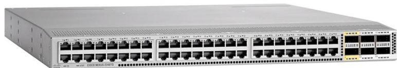
Figure 4. Cisco Nexus 2348TQ Fabric Extender (Port View)

The Nexus 2348TQ (Figure 4) is a low-power platform that is well suited for migration to 10GBASE-T. It supports high-density 100 Megabit Ethernet and 1 and 10 Gigabit Ethernet environments and has 48 x 100MBASE-T and 1/10GBASE-T host interface (HIF) ports as well up to six 40-Gbps uplink ports to the parent switch. The 40-Gbps uplinks support BiDi optics for simple connectivity using your existing cable plan, while lowering power and solution costs. The Cisco Nexus 2348TQ supports FCoE.