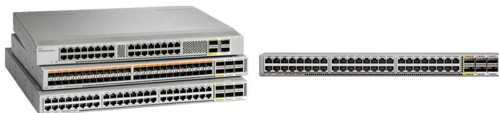
Figure 1. Cisco Nexus 2300 Platform Fabric Extenders: Cisco Nexus 2332TQ (Top Left), Cisco Nexus 2348UPQ (Middle Left), Cisco Nexus 2348TQ (Bottom Left), and Cisco Nexus 2348TQ-E (Right)

The Cisco Nexus 2300 platform has a compact 1RU design that aligns with server designs. It offers front-to-back cooling that is compatible with data center hot-aisle and cold-aisle designs. All switch ports are at the rear of the unit close to server ports, and all user-serviceable components are accessible from the front panel. The platform also offers back-to-front cooling, with switch ports in the front of the chassis aligned with the cold aisle for optimized cabling in network racks. The Cisco Nexus 2300 platform is built for nonstop operation with redundant hot-swappable power supplies and a hot-swappable fan tray with redundant fans. The 1RU form factor takes up little space, making it easy to incorporate into rack designs. The fabric extenders are available in several models with a range of speed, connectivity, and port-density options (Figure 1).