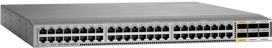
Figure 8. Cisco Nexus 2348TQ-E Fabric Extender (Port View)

The Nexus 2348TQ-E (Figure 4) is a cost optimized platform that is well suited for migration to 10GBASE-T. It supports high-density 100 Megabit Ethernet and 1 and 10 Gigabit Ethernet environments and has 48 x 100MBASE-T and 1/10GBASE-T Host Interface (HIF) ports as well up to six 40-Gbps uplink ports to the parent switch. The 40-Gbps uplinks support BiDi optics for simple connectivity using your existing cable plan, while lowering power and solution costs. The Cisco Nexus 2348TQ-E supports FCoE.