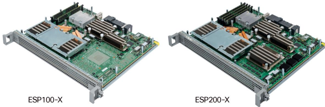
Figure 2. Cisco ASR 1000 Series ESP 100-X and ESP 200-X