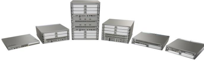
Figure 2. New Cisco ASR 1001-X Aggregation Services Router