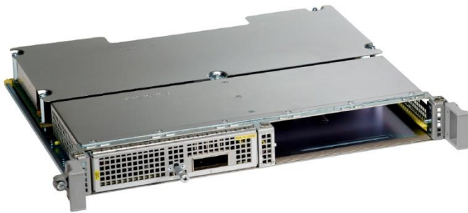
Figure 4. Cisco ASR 1000 Series 1-port 100 Gigabit Ethernet Port Adapter