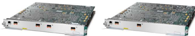
Figure 2. Cisco 7600 Series ES Plus Transport Line Cards: 20-Port GE and 40-Port GE