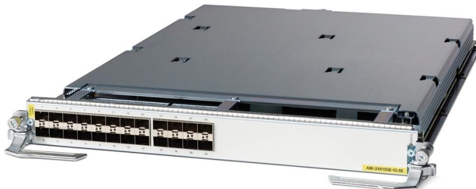
Figure 1. Cisco ASR 9000 Series 24-Port Dual-Rate 10GE/1GE Line Card

The physical interfaces on these line cards support both Small Form-Factor Pluggable (SFP) and Enhanced SFP (SFP+) optics for long- and short-haul applications, enabling migration and support for numerous deployment scenarios requiring different media types and flexible interface modes. With these capabilities, the ASR 9000 Series line cards (Figure 1 and Figure 2) and routers provide the fundamental infrastructure for scalable Carrier Ethernet and IP/Multiprotocol Label Switching (IP/MPLS) networks, promoting profitable business, residential, and mobile services.