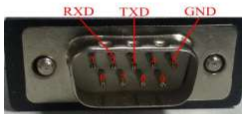
Fig2. Male type pins definition of RS_232 Port

Male type pins definition of RS_232 Port is shown in Fig 2.