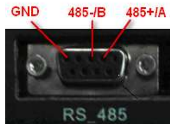
Fig1. RS_485 port definition

The RS_485 definition is shown in Fig 1.