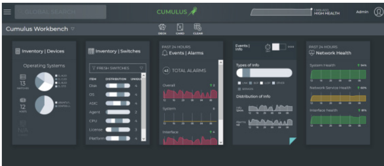
FIGURE 2: CUMULUS NETQ GUI

Unlike other network operations tools, NetQ delivers significant operational improvements to your network management and maintenance processes. It simplifies the data center network by reducing the complexity through real-time visibility into hardware and software status and eliminating the guesswork associated with investigating issues through the analysis and presentation of detailed, focused data.