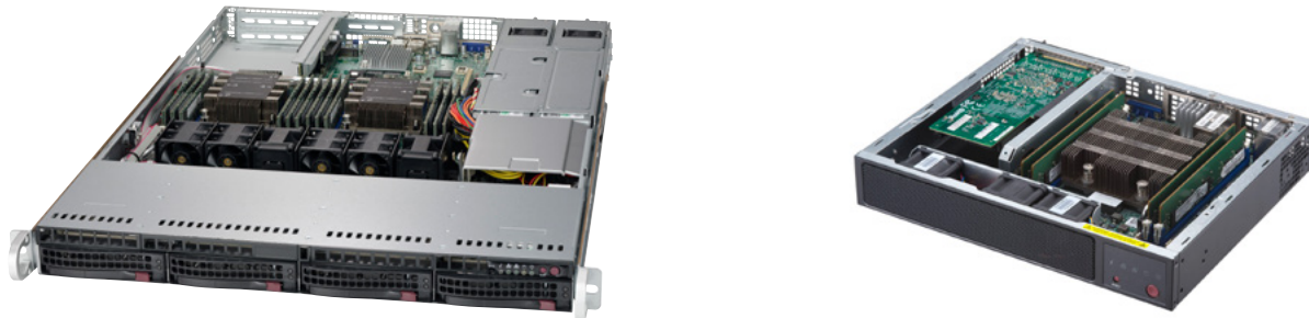
FIGURE 3: NETQ HARDWARE AND NETQ CLOUD APPLIANCES