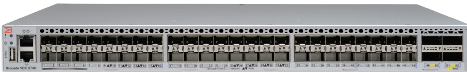
Figure 1: The Brocade VDX 6740 Switch provides 48 10 GbE SFP+ ports and four 40 GbE QSFP+ ports.

As data centers virtualize more of their servers and VM density per server increases, organizations will require higher bandwidth connectivity to support the explosion of data and application processing. With 1/10 GbE connections, Brocade VDX 6740, 6740T, and 6740T-1G Switches deliver the high-performance computing needed to keep up with the demands of a virtualized data center, allowing organizations to reduce network congestion, improve application performance, and meet the capacity required by 1 GbE and 10 GbE servers. The 40 GbE uplinks can easily