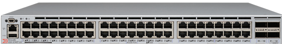
Figure 3: The Brocade VDX 6740T-1G Switch provides 48 1000BASE-T/10GBASE-T ports and four 40 GbE QSFP+ ports.