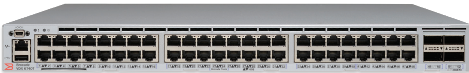
Figure 2: The Brocade VDX 6740T Switch provides 48 1000BASE-T/10GBASE-T ports and four 40 GbE QSFP+ ports.