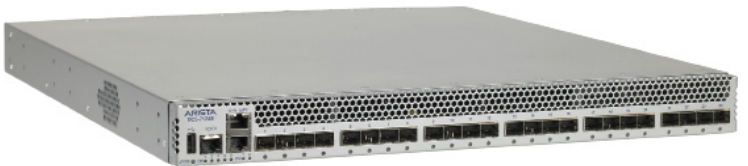
Arista 7124S: 24-port 10 GbE 480 Gbps, 360 Mpps, L2/3/4, 1U Switch (SFP)