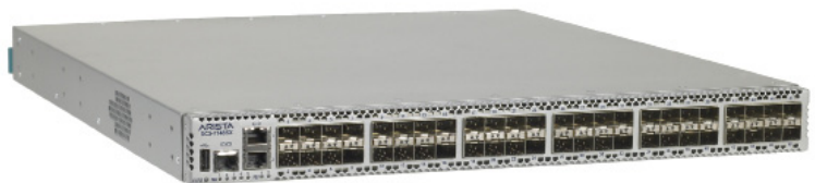
Arista 7148SX: 48-port 10GbE 960 Gbps, 720 Mpps, L2/3/4, 1U Switch (SFP)

The Arista 7100 Series is a family of high performance, very low latency layer 2/3/4 10 Gigabit Ethernet data center switches. Offered with 24 and 48 ports in a compact 1RU chassis with redundant power and cooling, the Arista 7100 Series features front-to-rear airflow when mounted in either direction for flexible rack-top server aggregation deployments. All ports accommodate the full range of 10GbE SFP+ or GbE SFP optical or copper physical layer options, allowing for maximum flexibility and investment protection as customers of all sizes migrate their server connections from Gigabit to 10 Gigabit Ethernet.